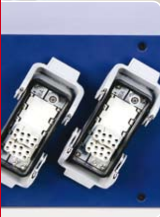
208V system 400V: other side